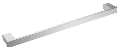
AI1413C Bright finish