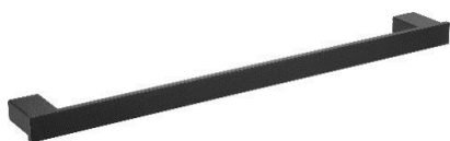
AI1413B Black finish